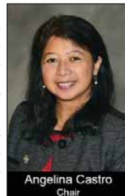
Angelina Castro Chair

immigrant youth without parents or legal guardians from the custody of the Department of Health and Human Services to ICE-contracted jails once they turned 18. In a nationwide class action suit, the District Court for the District of Columbia found that ICE had engaged in "pervasive violations" of U.S. immigration laws that required placements in the least restrictive settings available and meaningful alternatives to detention, as required by amendments to the Trafficking Victims Protection Reauthorization Act (TVPRA). The court issued a permanent injunction based on ICE's "pattern of agency recalcitrance and resistance to the fulfillment of its legal duties." See Garcia Ramirez v. ICE , No. CV 18-508 (RC), 2021 WL 4284530 (D.D.C. Sept. 21, 2021).