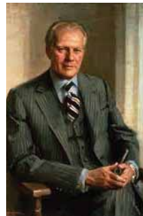
Gerald R. Ford

The time commitment for this project is not egregious, and you are encouraged to team up with a colleague. We have learned from our volunteers that this is a very fun experience, you will be as much a beneficiary as the students, and this is an excellent public service project for the Bar (and for you and your firm). Schools are required by Federal Law to conduct a special program during Constitution Week. In recently signing three bills "that prioritize civic education in our schools," Governor Ron DeSantis remarked that "[t]he sad reality is that only two in five Americans can correctly name the three branches of government, and more than a third of Americans cannot name any of the rights guaranteed by the First Amendment. It is abundantly clear that we need to do a much better job of educating our students in civics to prepare them for the rest of their lives."